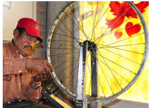
Day worker at the Downtown Los Angeles Day Labor Center learns bicycle repair skills.

The Graton Day Labor Center works with the Sonoma County Library Adult Literacy Program to provide workers with English language tutoring.