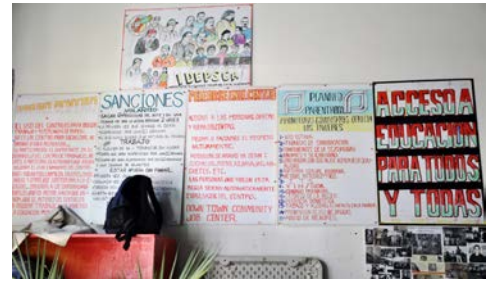
Workers at Los Angeles day labor centers develop and post rules and policies for each site.

While day labor centers' primary goal is to help match people who need work with those in need of workers, most centers also help day workers connect with service providers. According to the labor director of the San Francisco Day Labor Program, providing services that help workers stay healthy, learn English skills and find opportunities for community engagement enhances their ability to secure more stable work. Many centers find that providers of legal services can also be extremely helpful to day laborers. However each center will access the needs of its own day laborers, and there is a wide variety of services that workers may find useful.