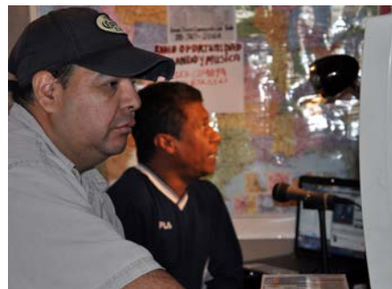
Day workers at the Downtown Los Angeles Day Labor Center produce their own online radio broadcasts.

Day worker populations may be significantly transient in some communities, and this can make