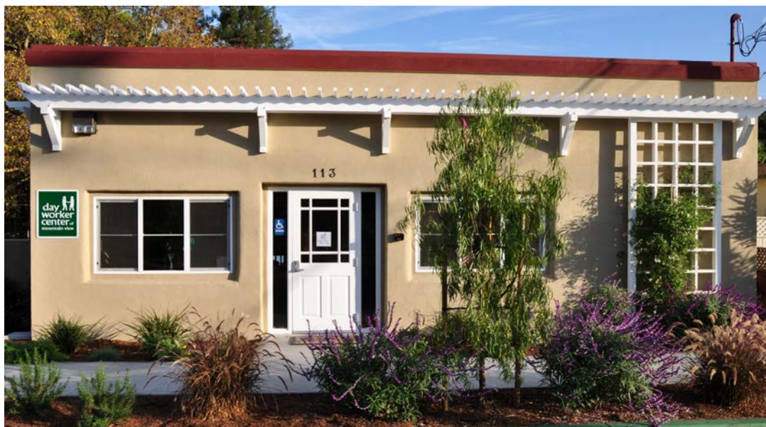
The Day Worker Center of Mountain View.

In Graton , a small unincorporated community in Sonoma County, a year-long facilitated consensus process, involving more than 50 people in approximately 25 meetings, created agreements that addressed concerns and created community support. In response to resident questions about the problem of excessive noise early or late in the day, the center limited its hours of operation. To address potential employers' concerns about communications issues, the center offers English classes. According to a county supervisor, bringing everyone to the table and surfacing the common interests was a key to this successful process.