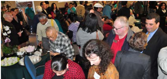
Day Worker Center of Mountain View welcomes community to open house.

Once a day labor center is established, the need for a good communications plan (see page 21 above) continues. It will be important to inform residents about the center's activities, address concerns and respond to rumors. As mentioned earlier, residents often know little about day workers or the role that day labor centers play, including the various services centers offer beyond employment opportunities. The importance of telling a center's story, and the stories of the day workers themselves, shouldn't be neglected.