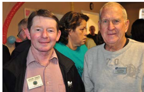
Local leaders attend Day Worker Center of Mountain View event.

There are examples of local officials who have not only approved day labor center sites but have assisted in the identification of suitable property for a center and helped change zoning ordinances to allow center operations. The City of Mountain View issued a conditional use permit to allow occupancy to the building purchased and renovated by that city's day worker center. The City also leased a parking lot adjacent to the day worker center, at no charge for twenty years, as a show of support for the center.