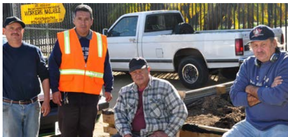
Day workers at the Harbor City Hiring Site in Los Angeles.

Reaching out to local nonprofit and community leadership, advocacy and service groups - including congregations and faith-based organizations - is an important step in day labor center planning and development. This outreach is useful as a way to broadly disseminate information about a developing a center and to perhaps identify groups and individuals with similar interests.