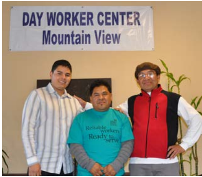
Day Worker Center of Mountain View workers and a staff member.

Labor Center participate in a city-sponsored “Christmas in April” event each year. Mountain